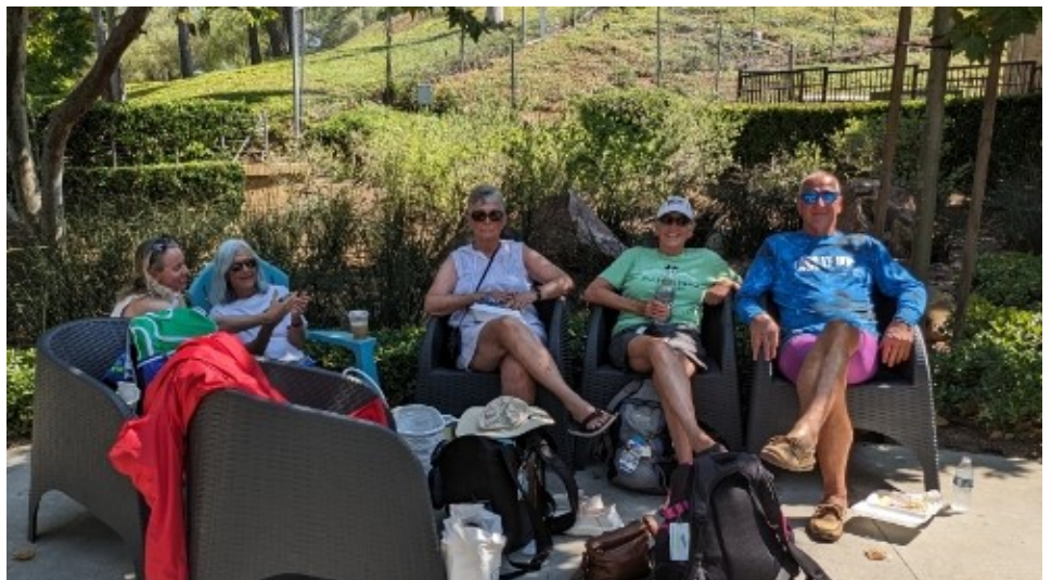
Wisconsin Team Relaxing After a Hard Week's Work