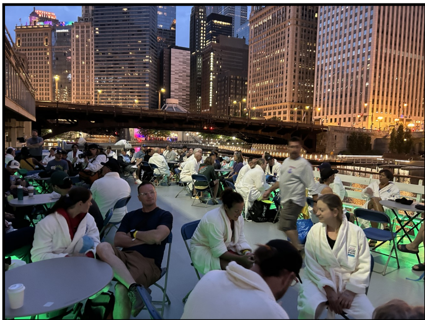
Swimmers in Bathrobes on Tour Boat to the Beach

Swim day itself was a little bizarre but nothing as bad as Big Shoulders two weeks prior. The course paralleled the lakeshore, out about 100 yards in a down and back configuration. Originally the swim was to run one mile out and one mile back (with a halfway turn around for the 1-milers). This meant (to my glee) that we would even be swimming outside the breakwater up to the Oak Street beach. But safety concerns again scaled the course back to 800 yards, with the 2-milers circling around the course two times.